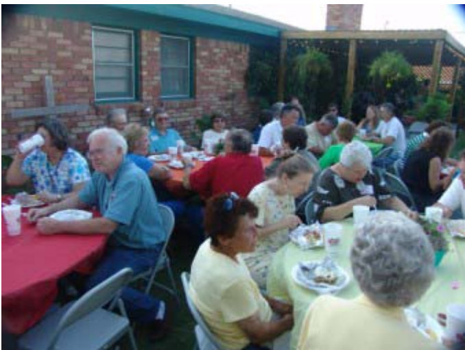
Friday afternoon social for the 2005 TAPS Conference in Amarillo. Great crowd, great food, lots of fun.

and which still insists on growing. Usually, bamboo can surround an entire neighborhood in six weeks. Not easily removed. Best solution: Sell your house and move to another house across town. Keep checking the local news in the newspaper and on TV; you may have to move again.