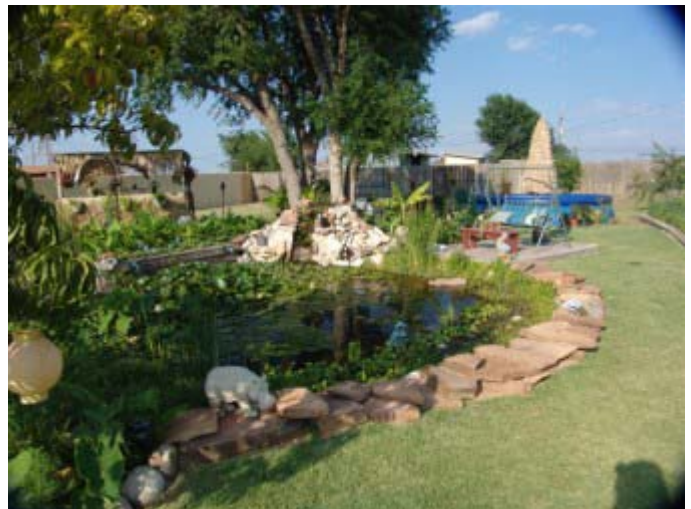
2005 TAPS Conference, at the Maxwell backyard just before the Friday evening social in Amarillo. These and many more photos are available on the Ogallala Water Gardeners website at www.owg-amarillo.us .