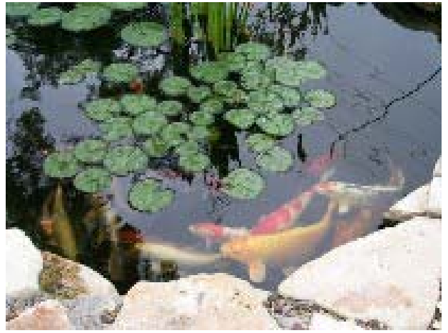
San Antonio has ponds that compete with the best of them, as can be seen in this photo from the San Antonio Pond Tour. This picture can be found on the Austin Pond Society web site along with many others at www.austinpondsociety.org